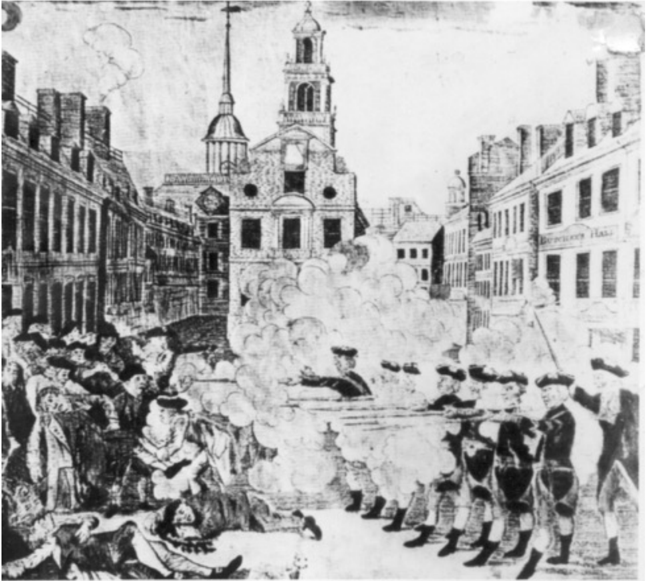
Source: Paul Revere Engraving of the Boston Massacre, 1770