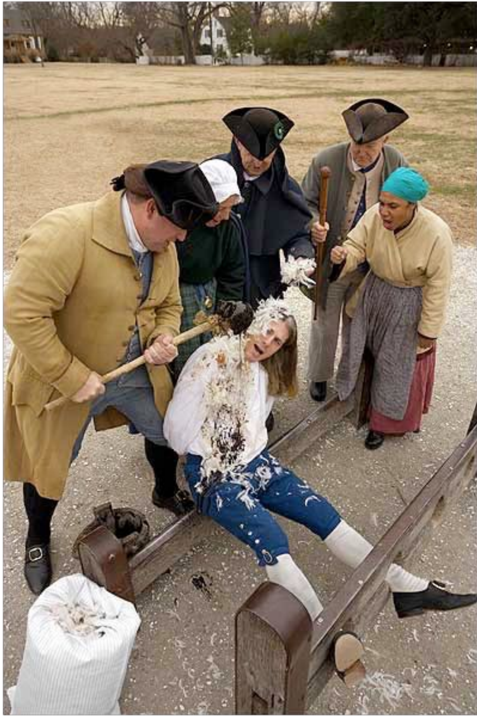
Tar and Feathering