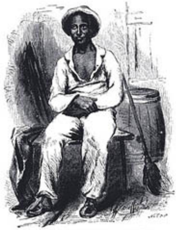
SOLOMON IN HIS PLANTATION SUIT. Solomon Northup